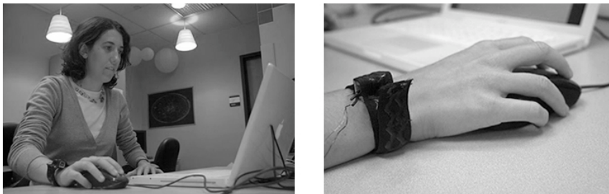
Fig. 1. Vibratory motor integrated into a bracelet to serve as a haptic feedback device.

We envision a context-aware wearable device that augments human memory with haptic cues. To this effect, a prototype of the wearable device has been implemented using a small vibratory motor. This motor is integrated into a bracelet that can be worn on a wrist or ankle and easily concealed by clothing (Fig. 1). The current prototype is powered by an external Atmel AVR microcontroller [10] board, although the final instantiation of the device would be controlled wirelessly. Distinct pulse signatures are produced by varying the motor speed, pulse length, and frequency. Each pulse is encoded by analogue signals, ranging from 0-255, with perceptible motor speeds starting at 120 (effectively, no pulse below the analogue signal of 120).